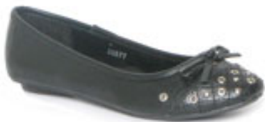
No eyelets or bows