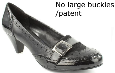
No large buckles /patent