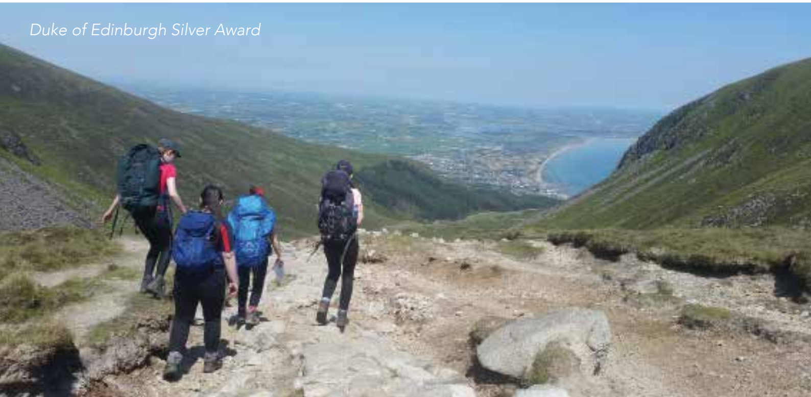
Duke of Edinburgh Silver Award

Careers Education, Information, Advice and Guidance (CEIAG) is an integral aspect of the educational provision at Strathearn. The Head of Careers is available for consultation by the students in School, and by parents and pupils at transition Parent Consultations and Parent Information Evenings. Outside speakers, university admissions staff and former pupils are regularly invited to the School to talk to pupils about a range of career opportunities.