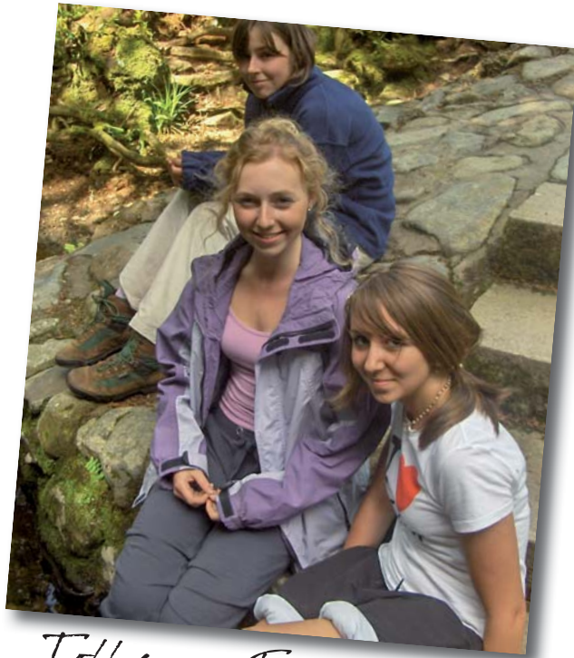
Tollymore Forest Park

The Award is a challenging and rewarding part of school life.