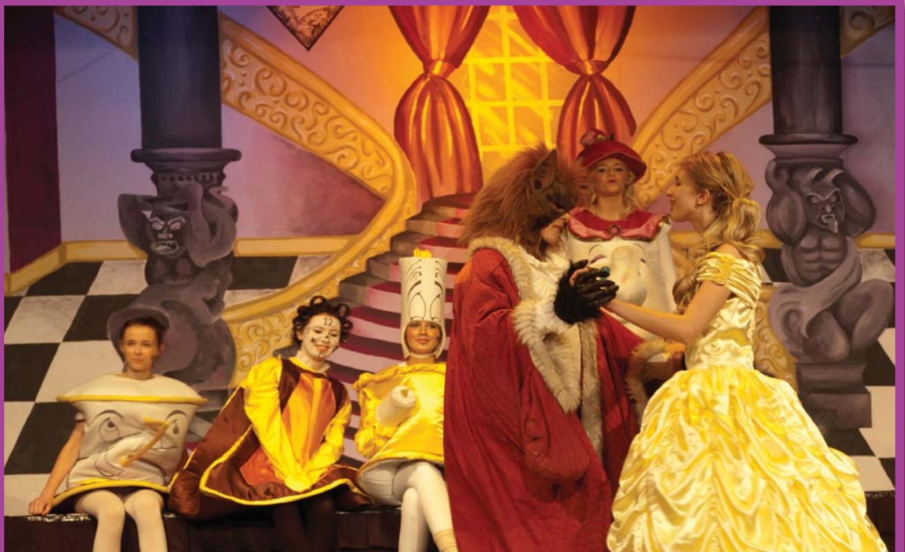
Beauty and the Beast